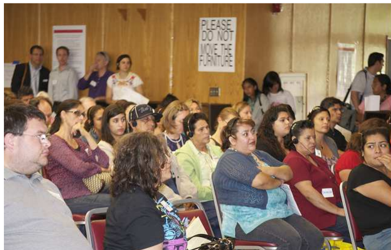
Bus riders listen to a speaker at the Ventura Healthy Kids Expo, cosponsored by ASERT. The event drew over 200 people.