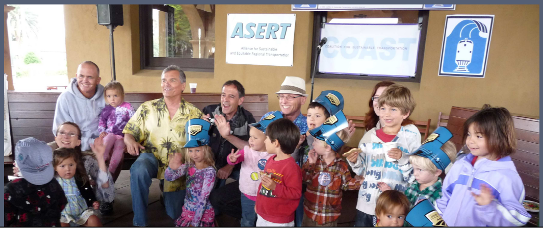
Train Day 2011: The next generation of rail aficionados