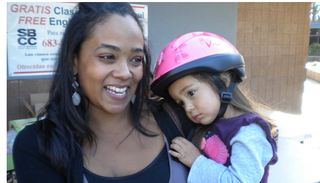
Monroe School: A very young customer's first helmet

Safe Routes to School is an international movement that encourages children to walk or bike to school and enables them to do so safely. As Congressman Oberstar has famously said, it is about "changing the habits of an entire generation." Toward this goal, Safe Routes to School uses a comprehensive approach that can be described under the four E's: Engineering, Enforcement, Education and Encouragement.