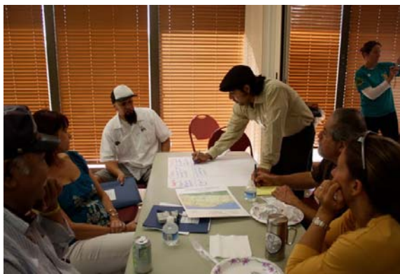
Participants record the results of their walking audit

On Saturday, November 14 th , Santa Barbara Walks hosted a special event at the Franklin Community Center. A team from The Berkeley Center for Traffic Safety and California Walks chose Santa Barbara as one of twelve sites