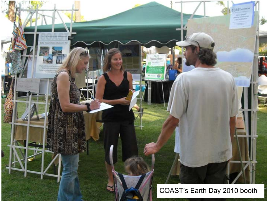
COAST's Earth Day 2010 booth