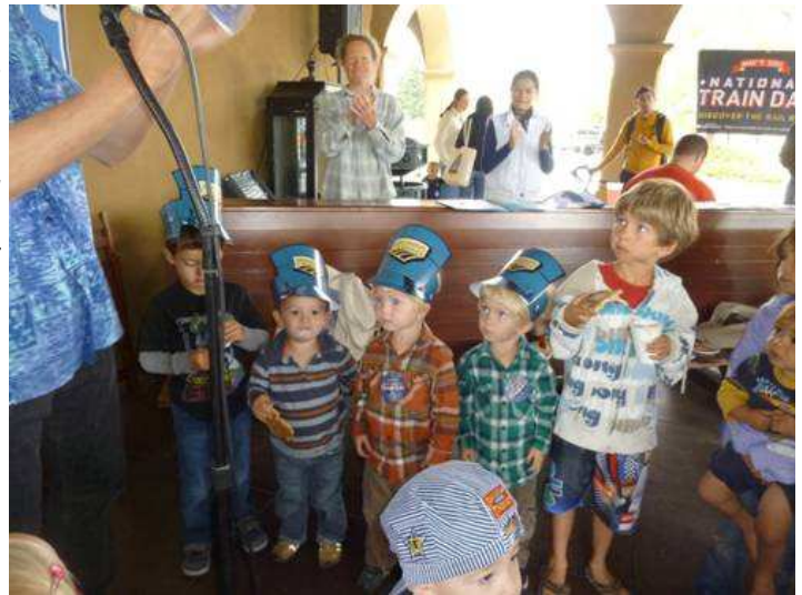
Train Day: An attentive young audience listens to a speech